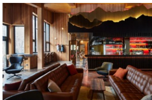
Victoria's European-Style Designer Ski Lodge TRAVEL