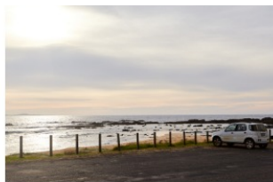
Roadtrip: Eurobodalla to the Sapphire Coast TRAVEL