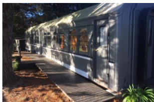
Stay in a Converted Train Carriage in the Southern Highlands TRAVEL