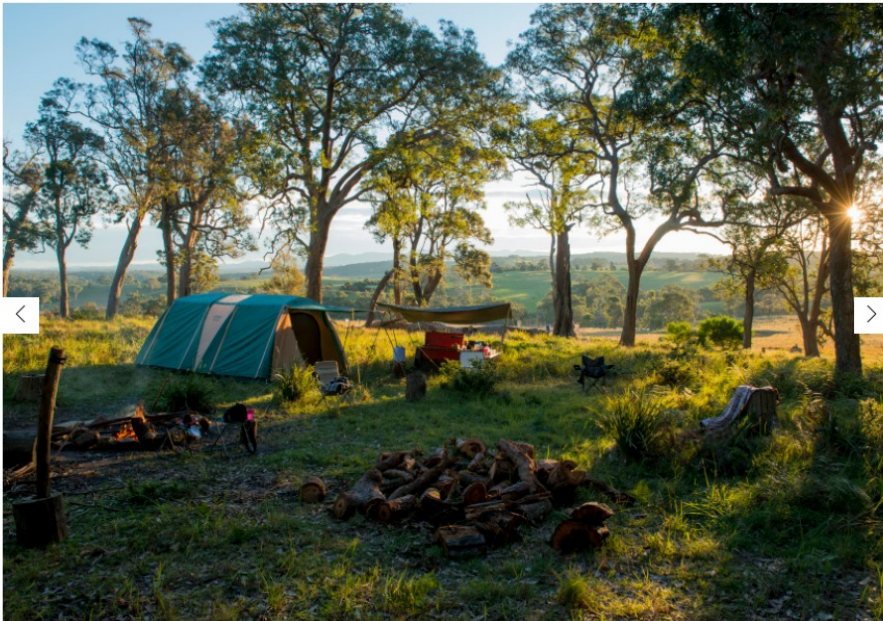
1/6 The campfire on the NSW South Coast where Youcamp.com was born

Stay on some of the most beautiful private properties in the country.