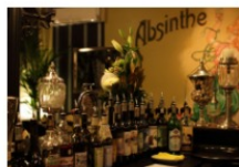
Absinthe Salon BAR