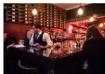
The Owl House BAR