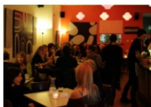
Buzzbar Cafe EVENT